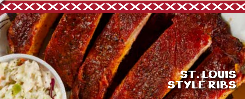
ST. LOUIS STYLE RIBS